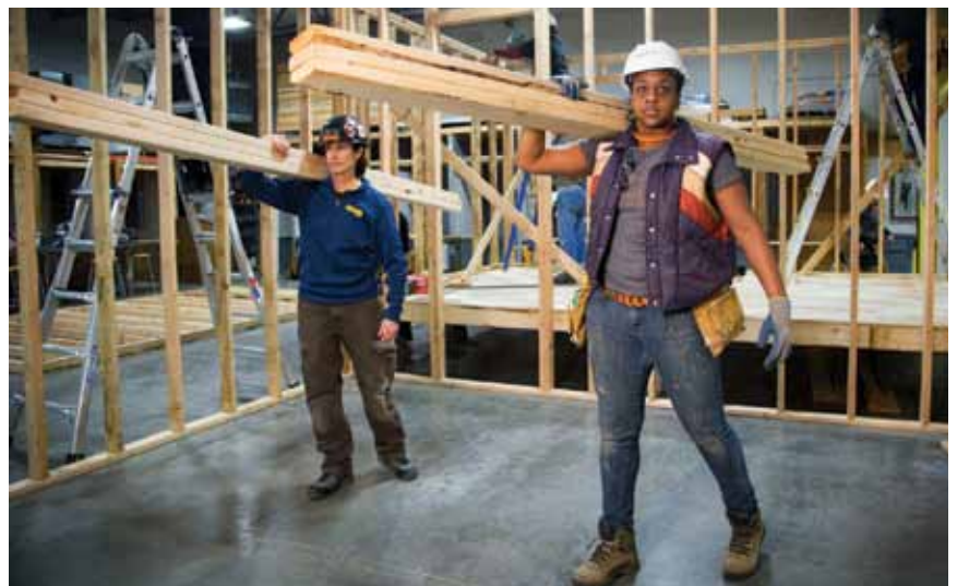
Learning how to lift in a safe manner is part of all programs.

This briefing paper profiles three women-only pre-apprenticeship programs 7 – Chicago Women in the Trades (CWIT), New York's Nontraditional Employment for Women (NEW), and Oregon Tradeswomen Inc. (OT) that are achieving impressive results